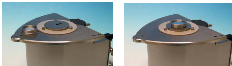
Fig. 1: The tool laying on the RheoScope module with the measuring plate removed (left), the tool in measuring position on top of the RheoScope module (right)